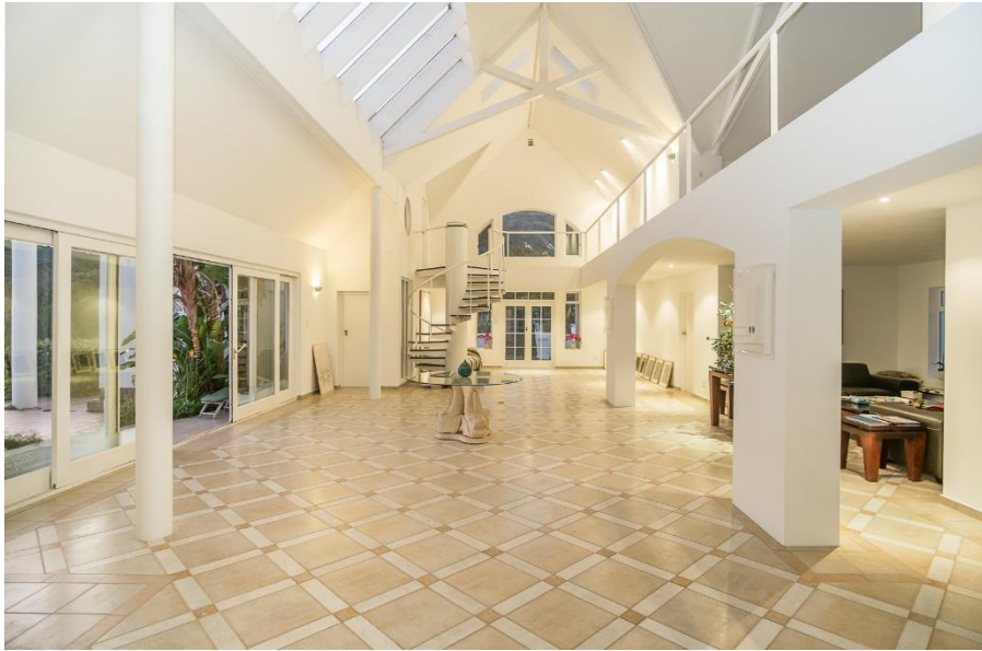
Double volume, open-plan living and dining area with large skylight and sliding doors opening to the garden with sea and mountain views.