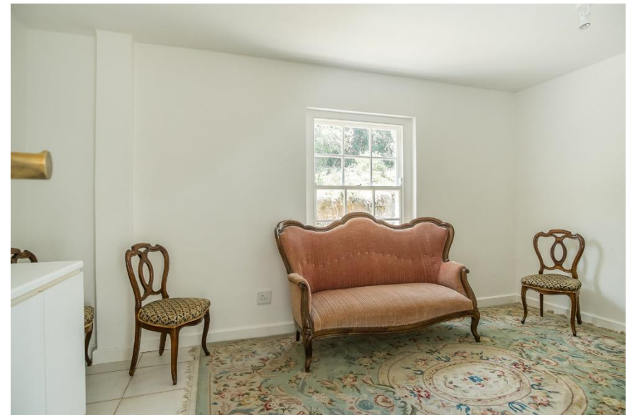
Bedroom 6 (downstairs).