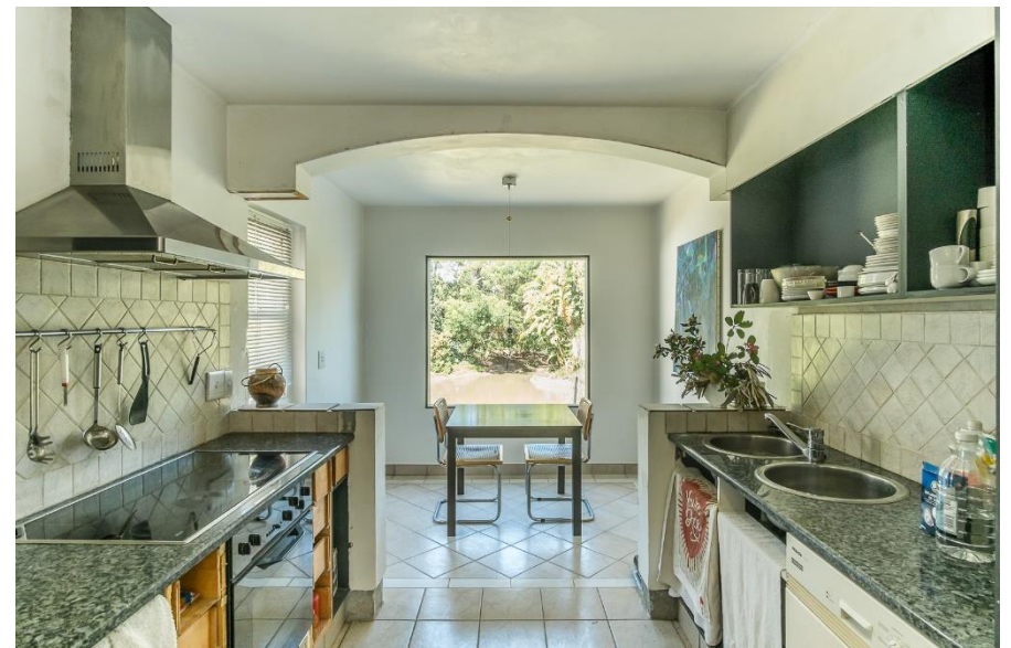
Kitchen - looking on to the dam.