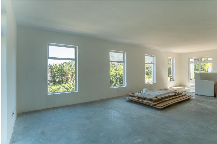
Bedroom 3 (downstairs) - sea and mountain views.