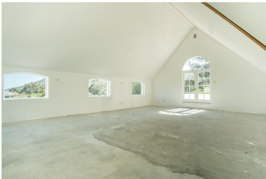
Bedroom 2 (upstairs) - balcony and potential en-suite.