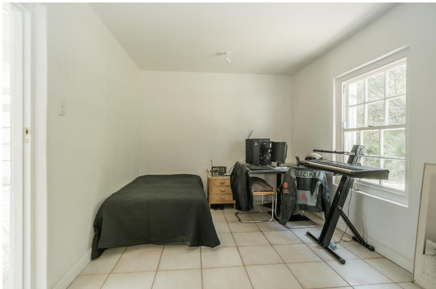
Bedroom 5 (downstairs).