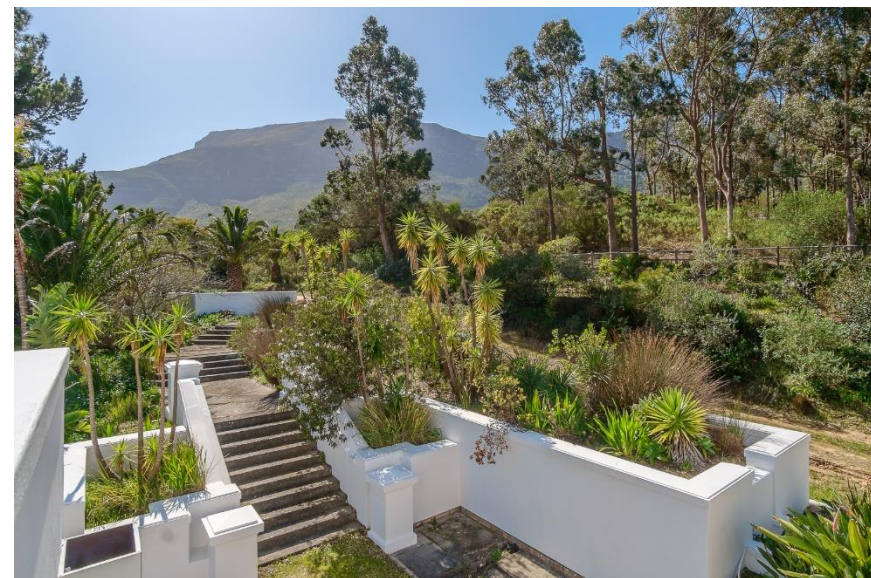
Bedroom 2 - view from balcony.