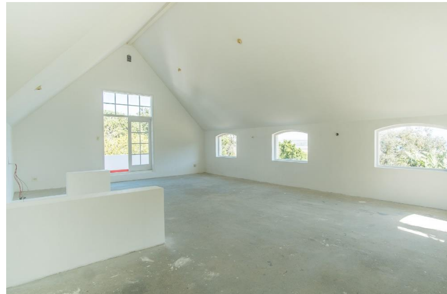
Bedroom 1 (upstairs) - balcony with sea and mountain views.