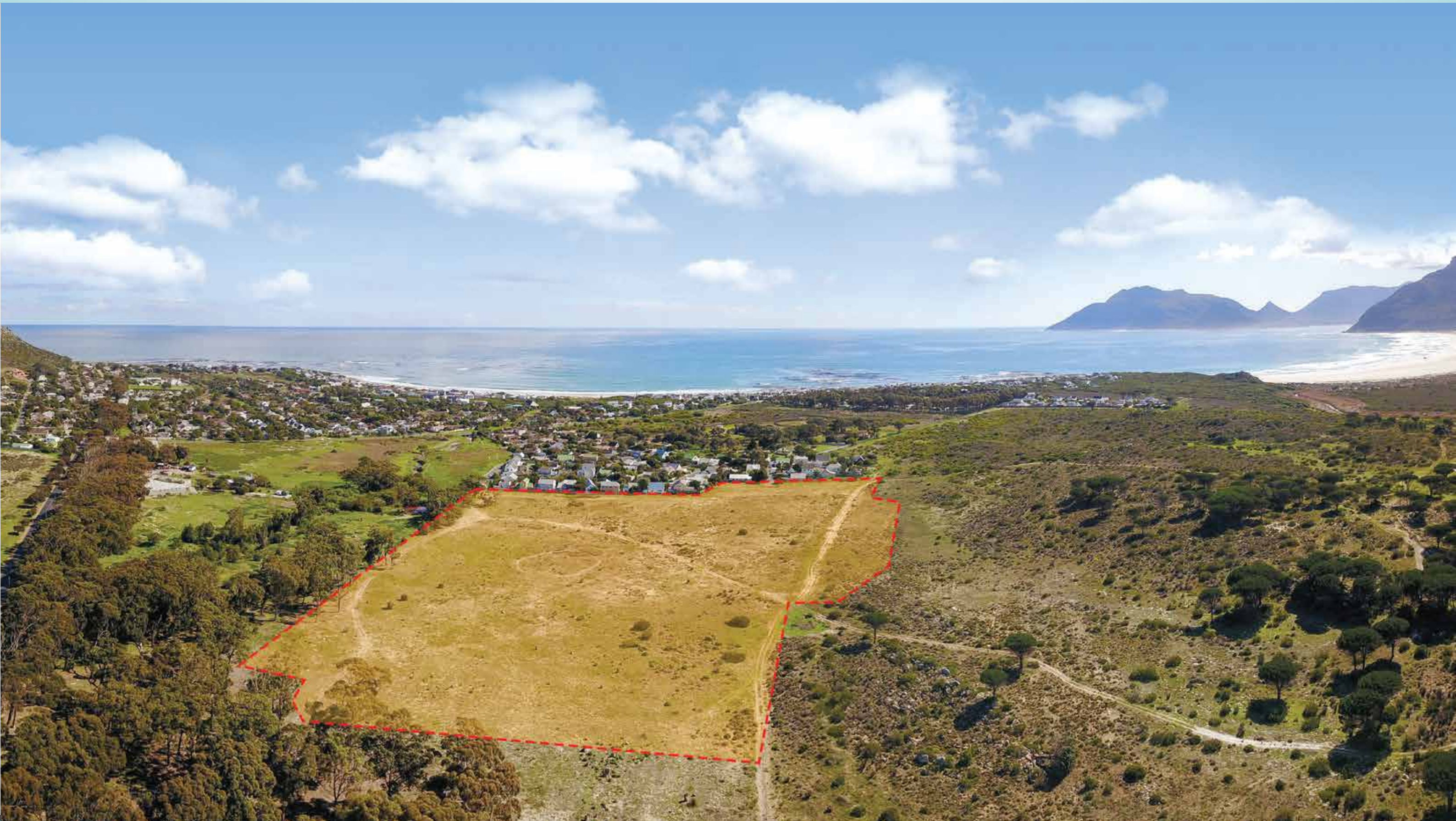
AERIAL SITE PHOTO