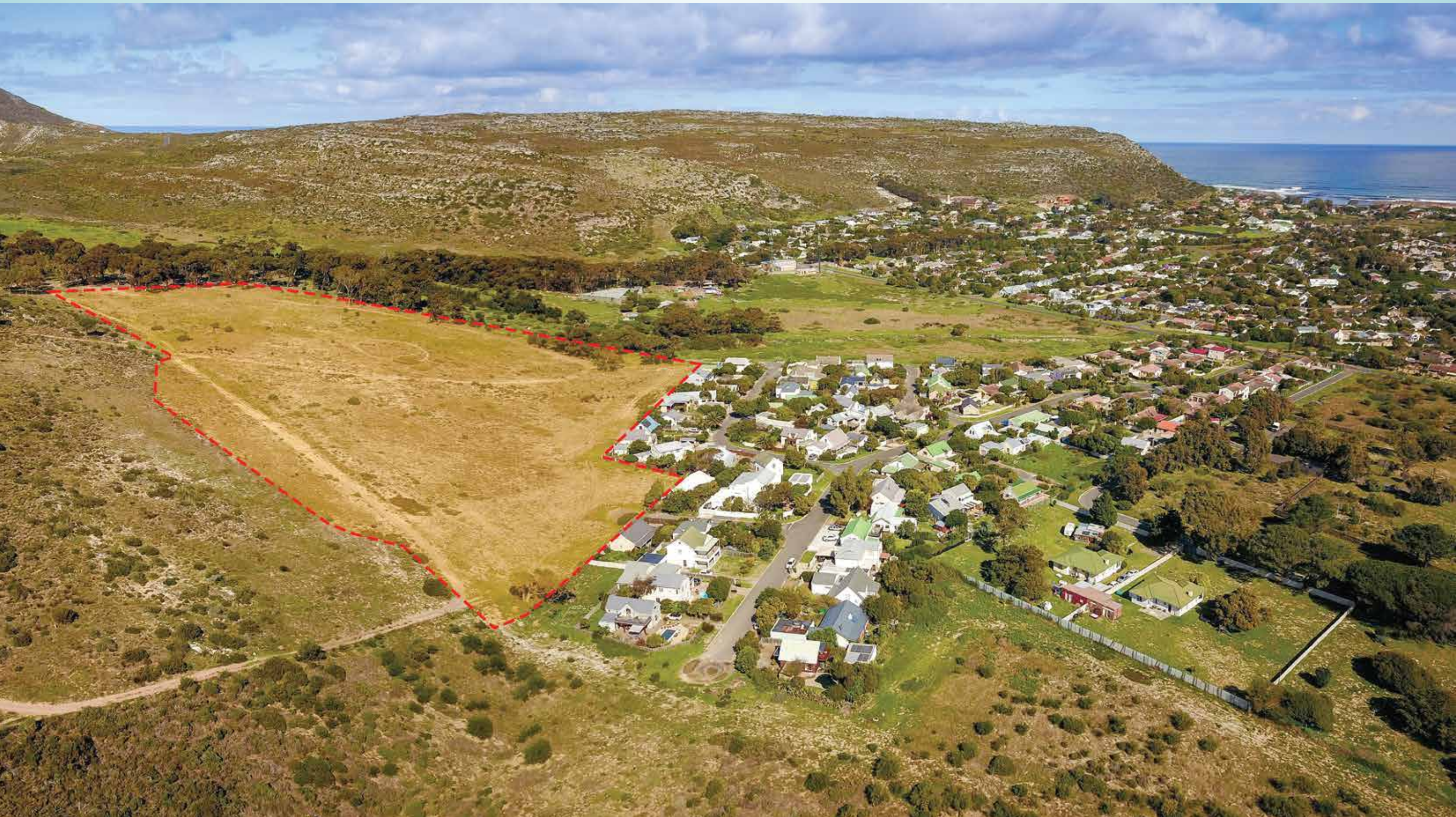
AERIAL SITE PHOTO