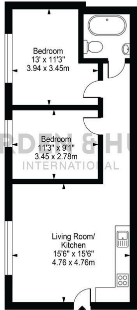
First Floor For Illustration Purposes Only - Not To Scale

This floor plan should be used as a general outline for guidance only and does not constitute in whole or in part an offer or contract. Any intending purchaser or lessee should satisfy themselves by inspection, searches, enquiries and full survey as to the correctness of each statement. Any areas, measurements or distances quoted are approximate and should not be used to value a property or be the basis of any sale or let.