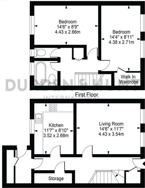
For Illustration Purposes Only - Not To Scale

This floor plan should be used as a general outline for guidance only and does not constitute in whole or in part an offer or contract. Any intending purchaser or lessee should satisfy themselves by inspection, searches, enquiries and full survey as to the correctness of each statement. Any areas, measurements or distances quoted are approximate and should not be used to value a property or be the basis of any sale or let.