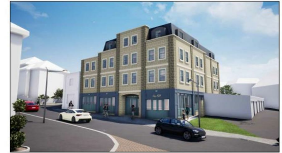
1. FRONT OF PROPOSAL FROM KING'S HOUSE CORNER