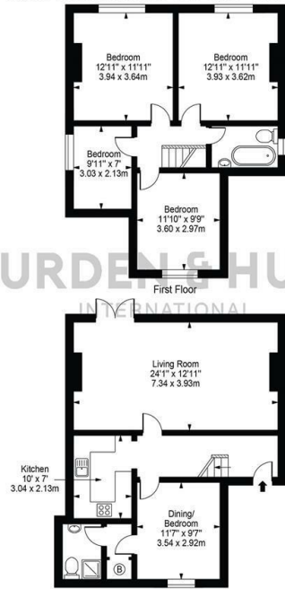
For Illustration Purposes Only - Not To Scale

West Grove Approx. Gross Internal Area 1268 Sq Ft - 117.84 Sq M