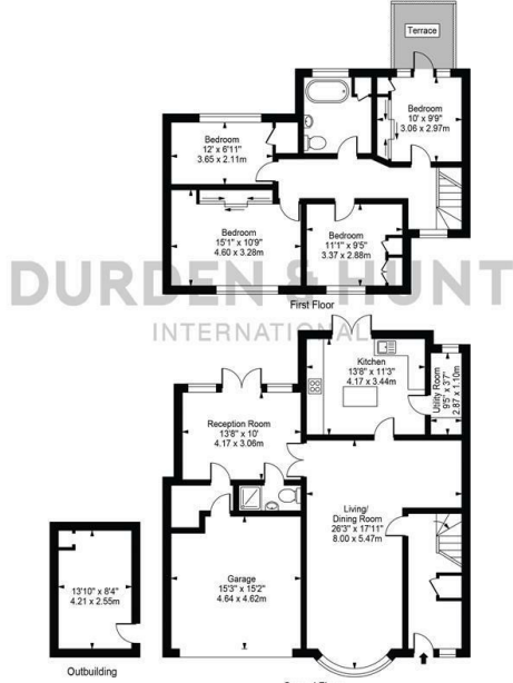
For Illustration Purposes Only - Not To Scale

Englands Lane Approx. Total Internal Area 1924 Sq Ft - 178.72 Sq M (Including Garage & Outbuilding) Approx. Gross Internal Area Of Garage 223 Sq Ft - 20.72 Sq M Approx. Gross Internal Area Of Outbuilding 116 Sq Ft - 10.74 Sq M