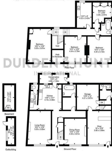
For Illustration Purposes Only - Not To Scale

Lambourne Road Approx. Total Internal Area 2828 Sq Ft - 262.74 Sq M (Including Outbuilding, Shop & Excluding Void) Approx. Gross Internal Area Of Outbuilding 54 Sq Ft - 4.98 Sq M Approx. Gross Internal Area Of Shop 599 Sq Ft - 55.68 Sq M