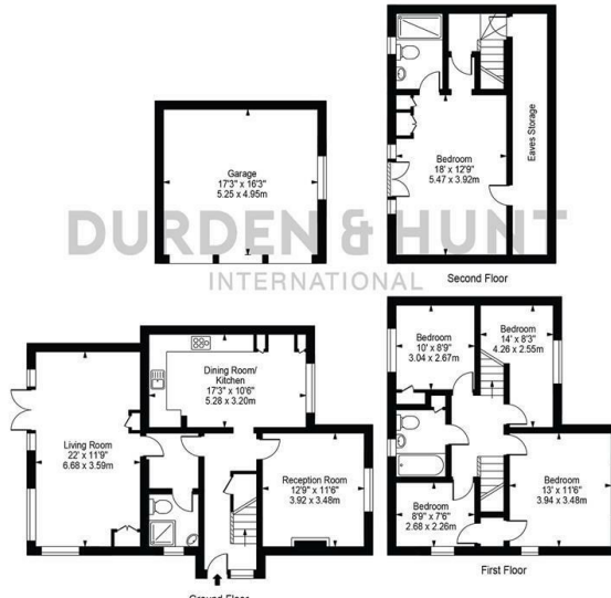
Ground Floor For Illustration Purposes Only - Not To Scale

Coopers Close Approx. Total Internal Area 2116 Sq Ft - 196.58 Sq M (Including Eaves Storage, Restricted Height Area & Garage) Approx. Gross Internal Area 1711 Sq Ft - 158.95 Sq M (Excluding Eaves Storage, Restricted Height Area & Garage) Approx. Gross Internal Area Of Garage 280 Sq Ft - 25.99 Sq M