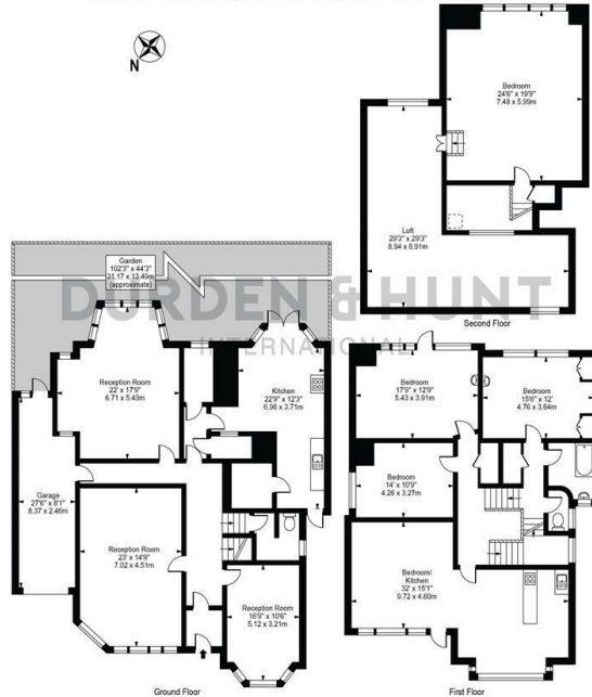
For Illustration Purposes Only - Not To Scale

Kings Avenue Approx. Total Internal Area 4328 Sq Ft - 402.10 Sq M (Including Garage) Approx. Gross Internal Area Of Garage 208 Sq Ft - 19.30 Sq M