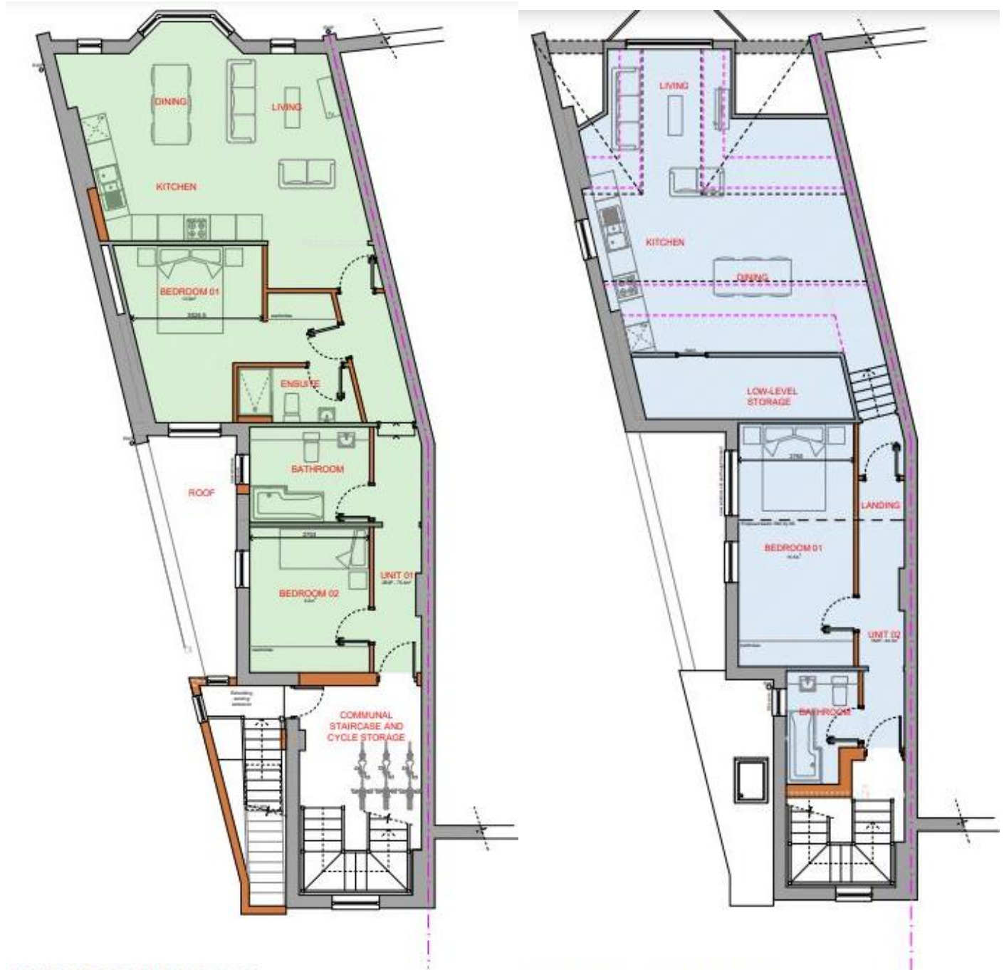
FIRST FLOOR PLAN @ 1:100