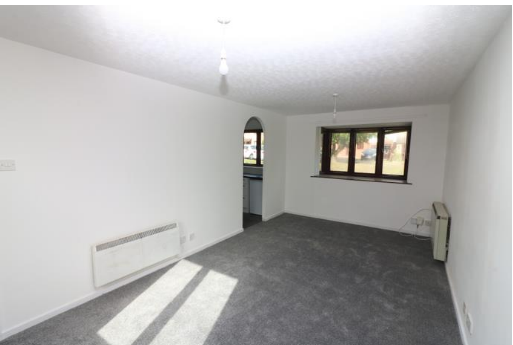
First Floor Approx. 56.4 sq. metres (607.5 sq. feet)