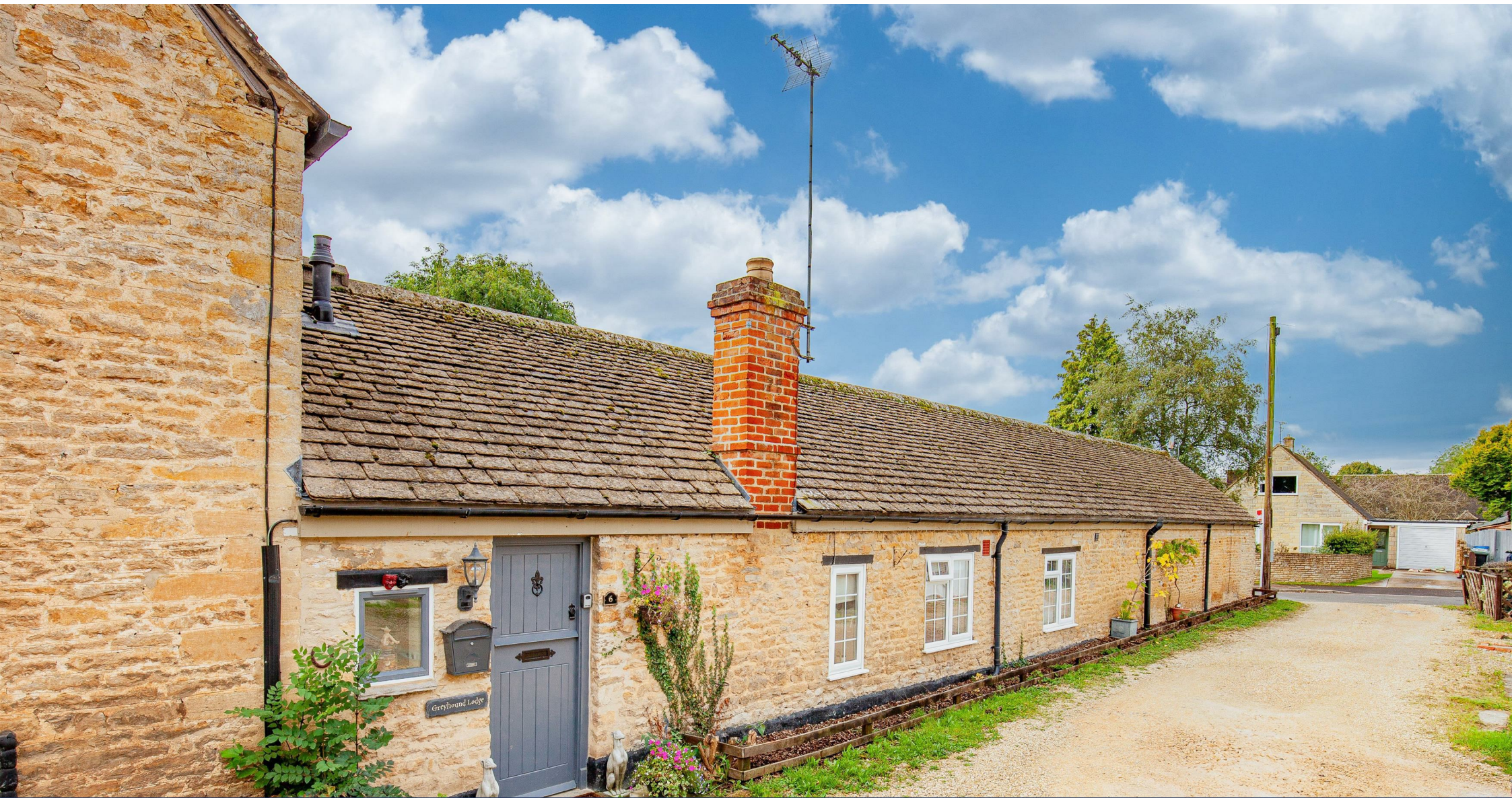
Greyhound Lodge 6 Home Close, Carterton, OX18 3GQ Guide Price £420,000