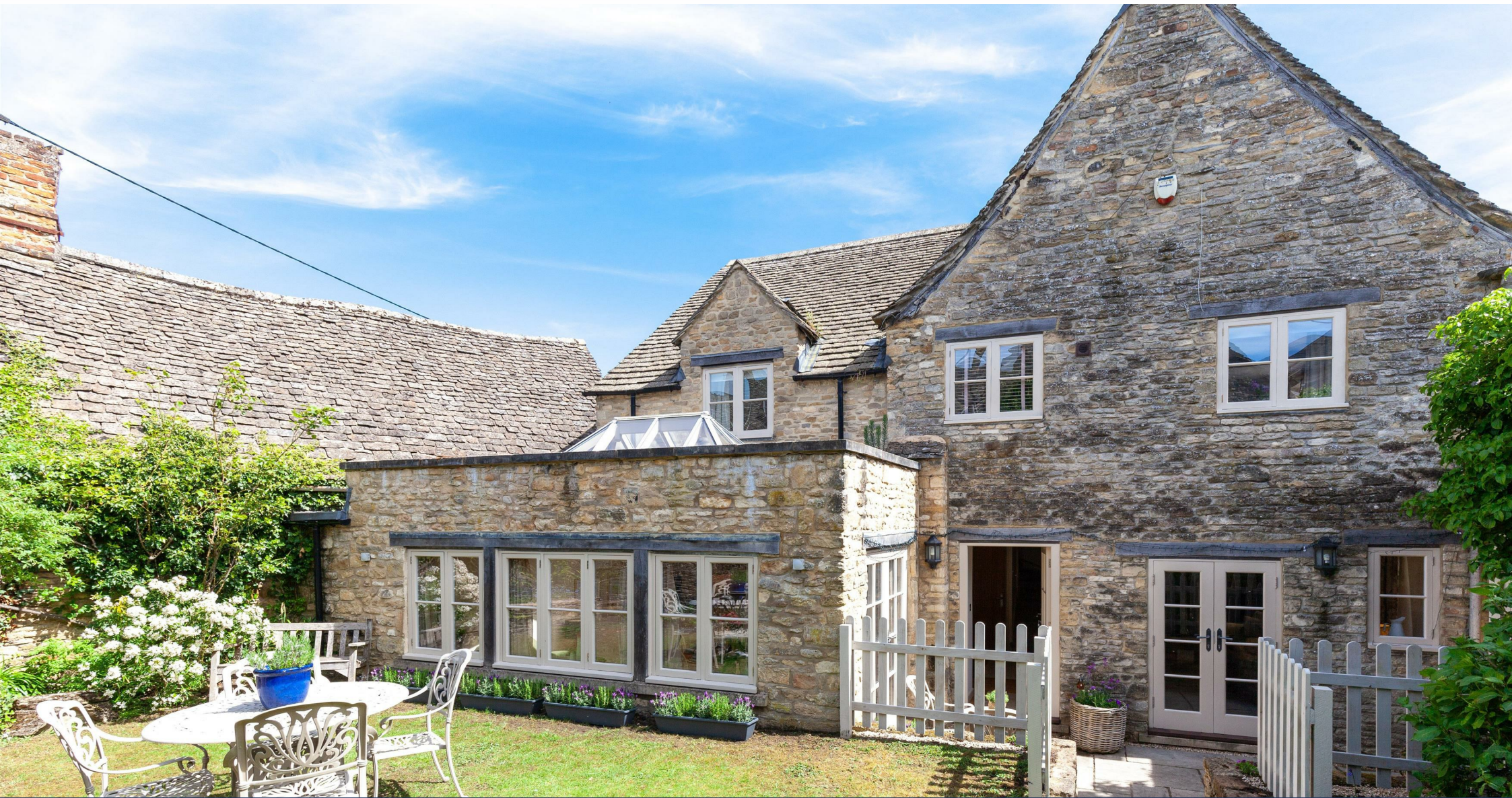
The Coach House 3 Witney Street, Burford, OX18 4SN Guide Price £799,000