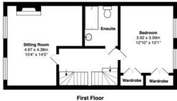
Approx Gross Internal Area 136.0 m<sup>2</sup> ... 1464 ft<sup>2</sup>

Whilst every attempt has been made to ensure the accuracy of the floor plan contained here, measurements of doors, windows, rooms, and any other items are approximate. No responsibility is taken for any error, omission, or mis-statement. This plan is for illustrative purposes only and should be used as such. Drawn by E8 Property Services. www.e8ps.co.uk