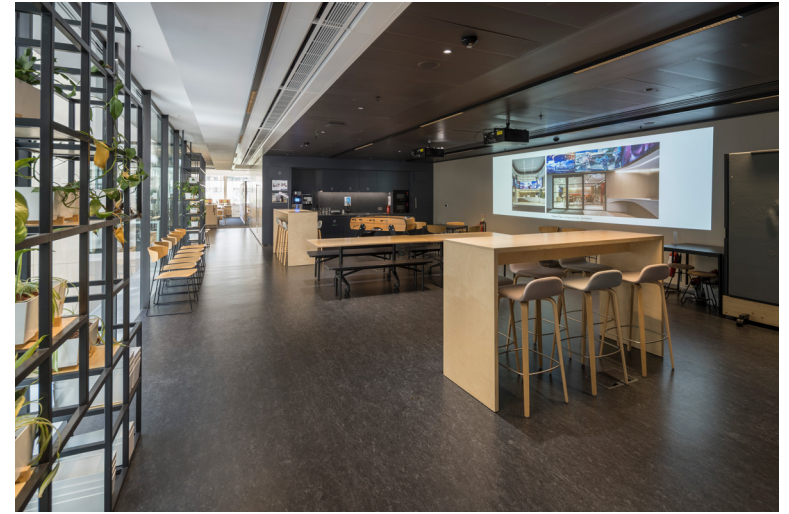
Café and breakout area