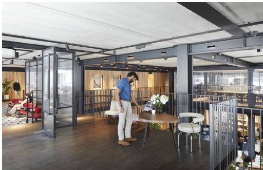
Reception at DL/78

Unlock a curated collection of features and benefits with the DL/App, available to all our tenants. Book DL/78 meeting rooms with discounted rates, secure a place at cultural events, lectures and screenings, and access exclusive offers and discounts on a wide range of products and services. You can manage it all effortlessly in a few clicks, and handy notifications ensure you never miss a thing.