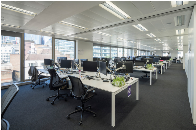
Open plan desk space along Whitechapel High Street