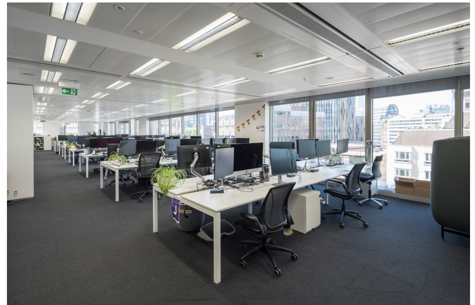
Open plan desk space with excellent natural light