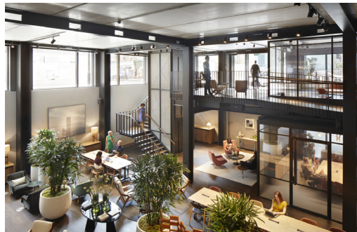
Club lounge at DL/78