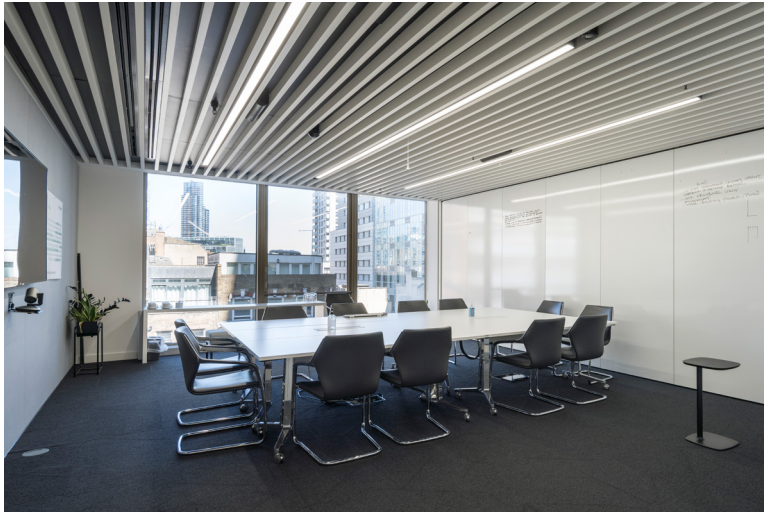
One of three 12 person meeting rooms