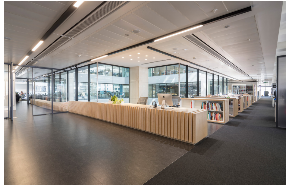
Arrival and reception area