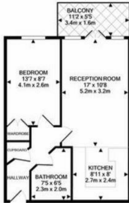
DRAKE HOUSE, LIMEHOUSE BASIN E14 - 2ND FLOOR TOTAL APPROX. FLOOR AREA 483 SQ.FT. (44.9 SQ.M.)

But every attempt has been made to ensure the accuracy of the floor plan contained here. Measurements of doors, windows, rooms and any other items are approximate and no responsibility is taken for any error, omission, or mis-statement. This plan is for illustrative purposes only and should be used as such by any prospective purchaser. The services, systems and appliances shown have not been tested and no guarantee as to their operability or efficiency can be given. Made with Metropix ©2020