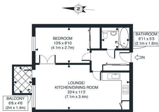
GROUND FLOOR GROSS INTERNAL FLOOR AREA 476 SQ FT