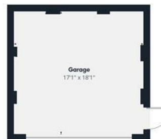
Ground Floor Building 3