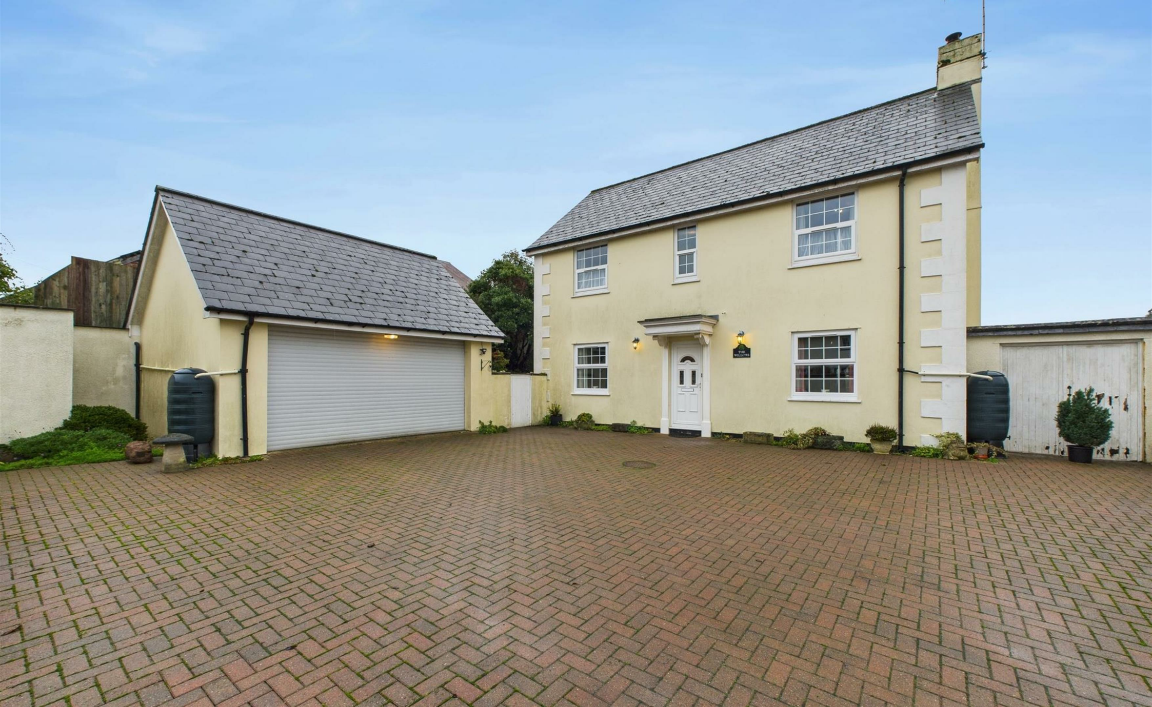
The Willows Cheriton Fitzpaine, CREDITON, EX17 4JH Price Guide £600,000 to £625,000