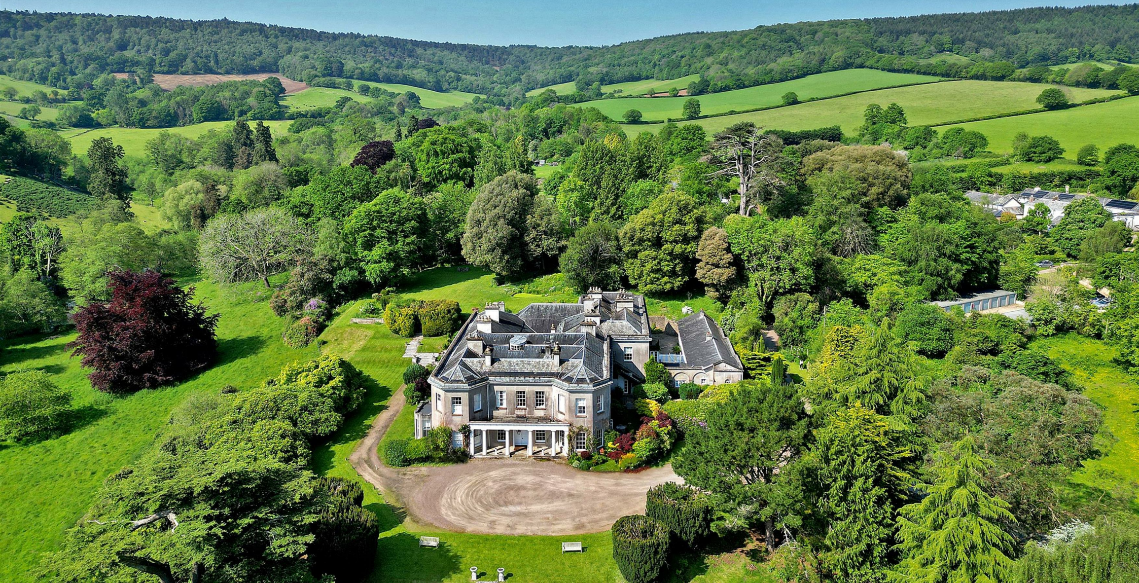
9 Oxton house Kenton, Exeter, EX6 8EX Price Guide £260,000