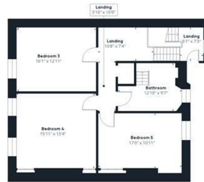
Floor 3 Building 1