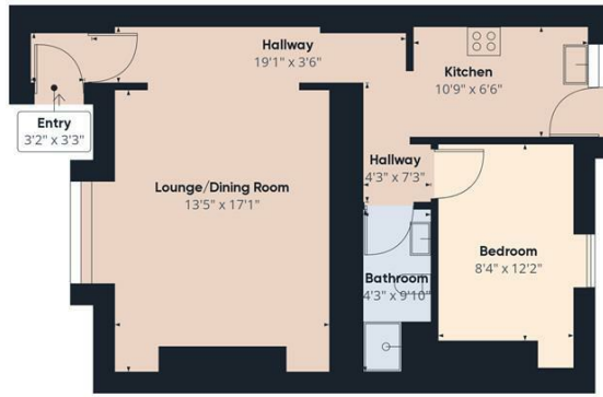
Self contained basement Flat