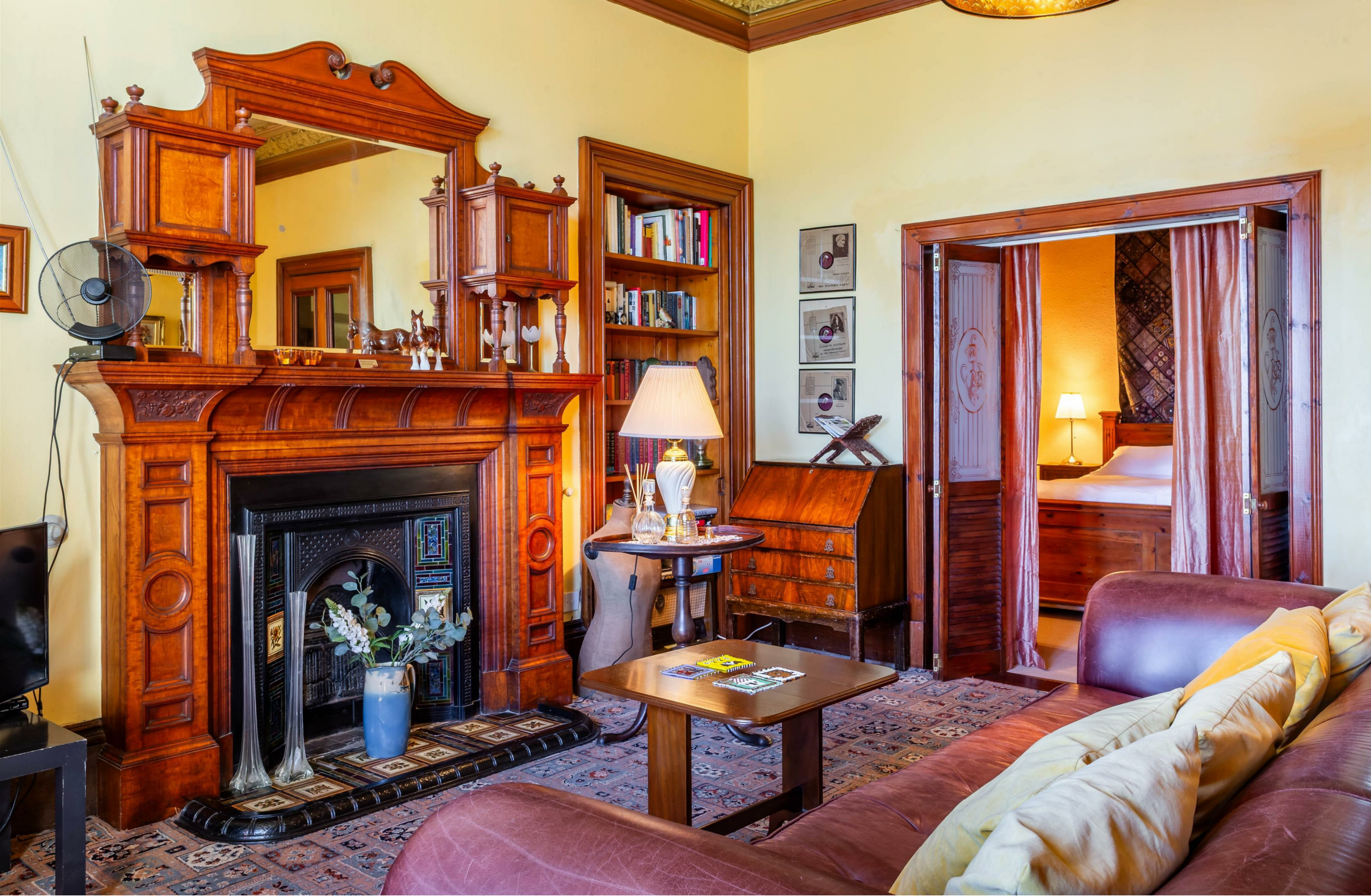
Kinneil Lamlash, Isle Of Arran, KA27 8JT