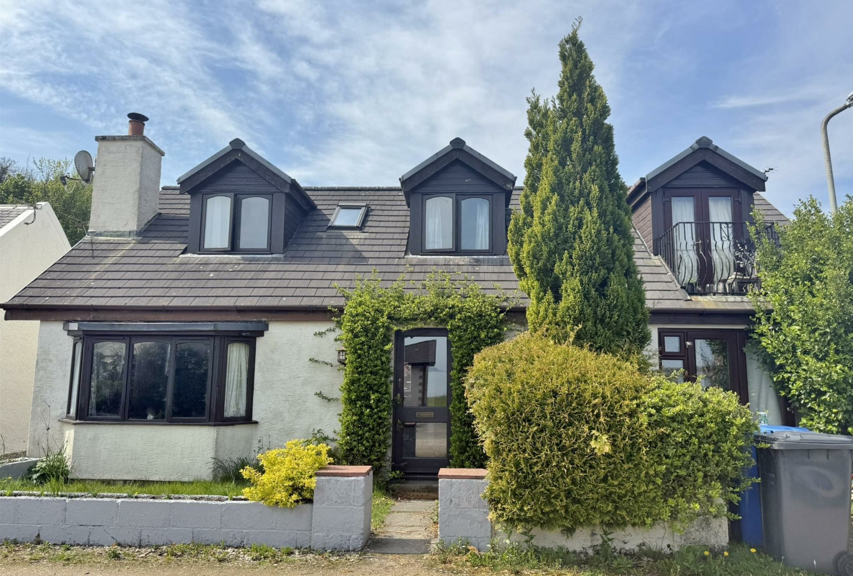
Sycamore Cottage, Cordon, Lamlash, Isle of Arran, KA27 8NQ