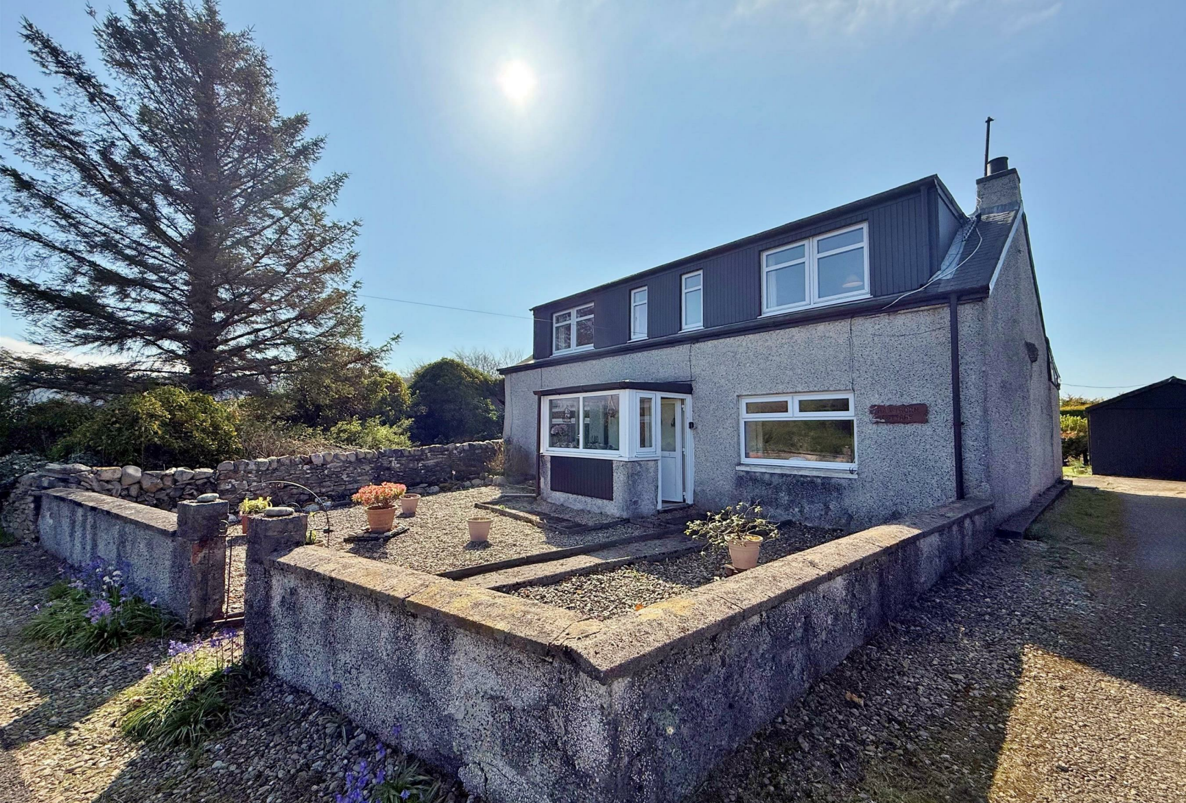
Hawthorn Cottage, Torbeg, Shiskine, KA27 8DU