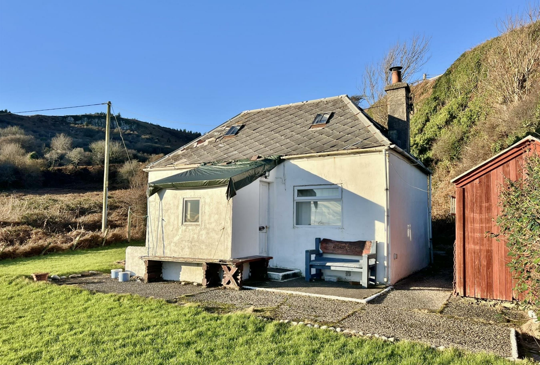
Shore Cottage, Largiebeg, Whiting Bay, Isle Of Arran, KA27 8RL