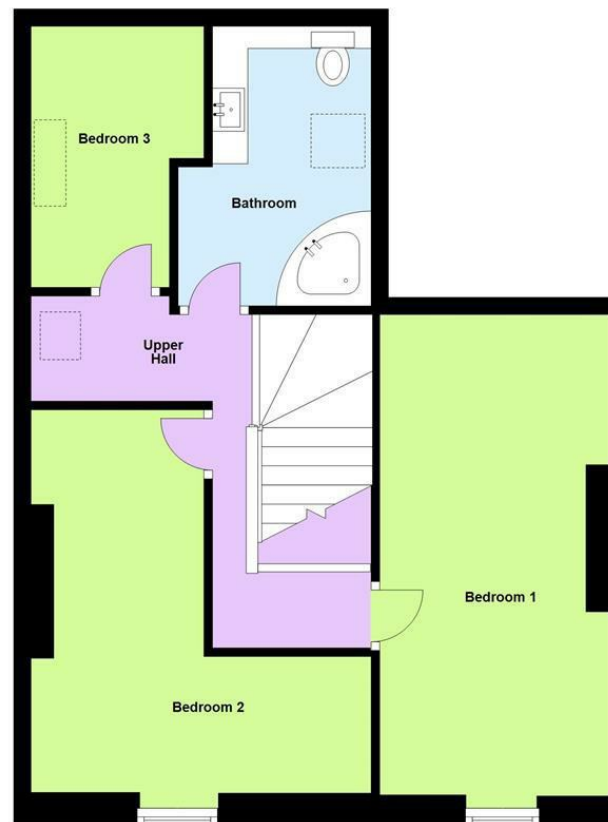
Caladh Beag First Floor

FLOOR PLAN NOT TO SCALE FOR GUIDANCE ONLY Plan produced using PlanUp.