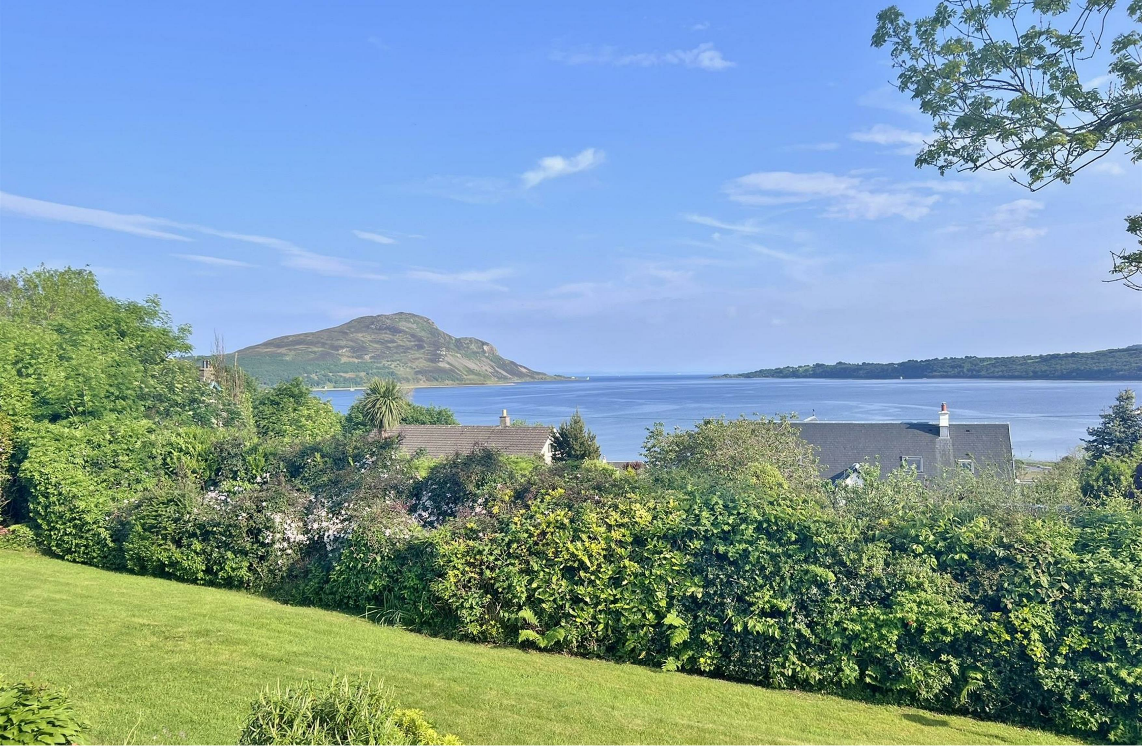
Highview 2 Kilbride Road, Lamlash, Isle Of Arran, KA27 8LJ