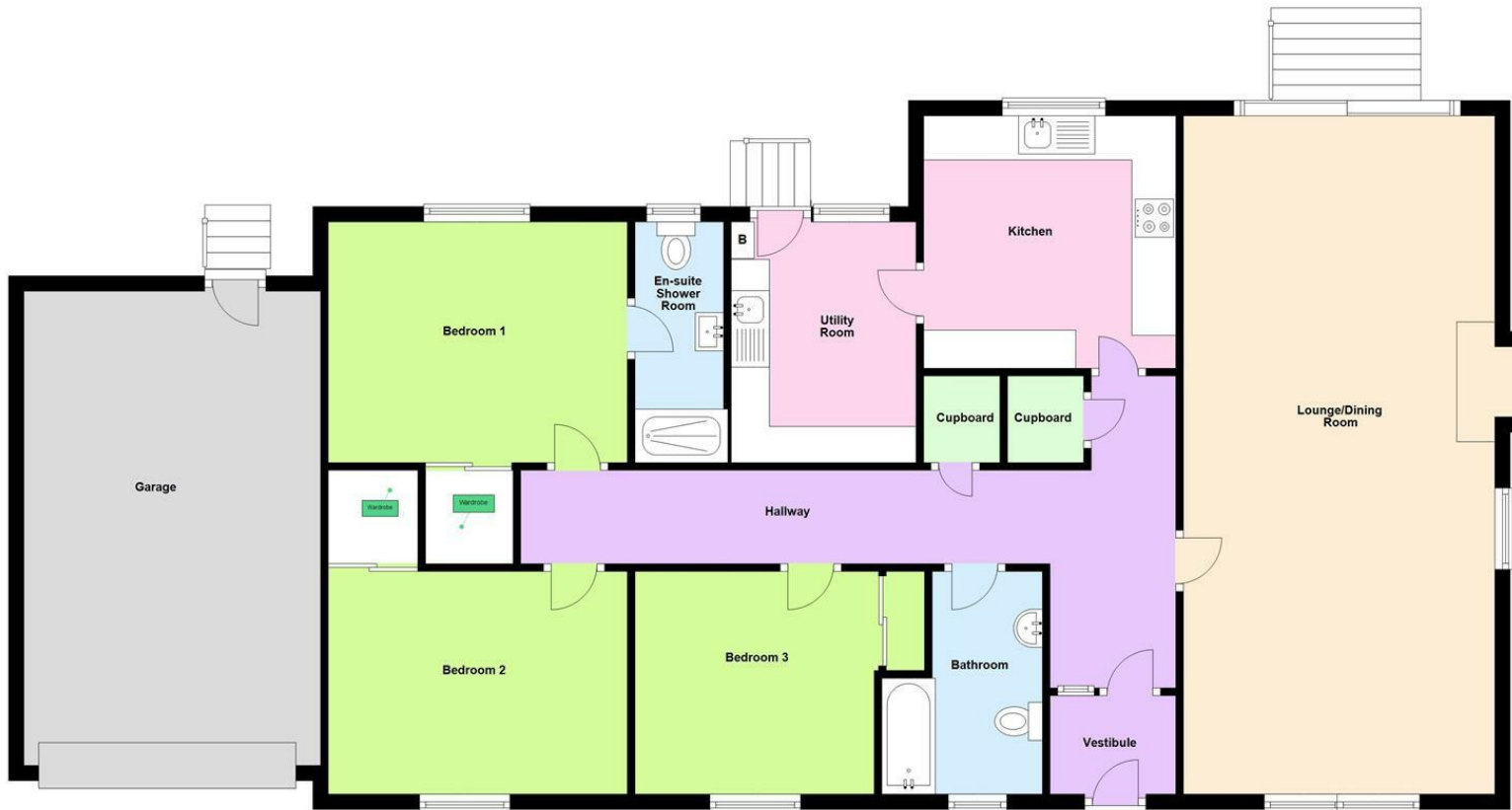
Highview 2 Kilbride Road Approx. 147.9 sq. metres (1591.5 sq. feet)

FLOOR PLAN NOT TO SCALE FOR GUIDANCE ONLY Plan produced using PlanUp.