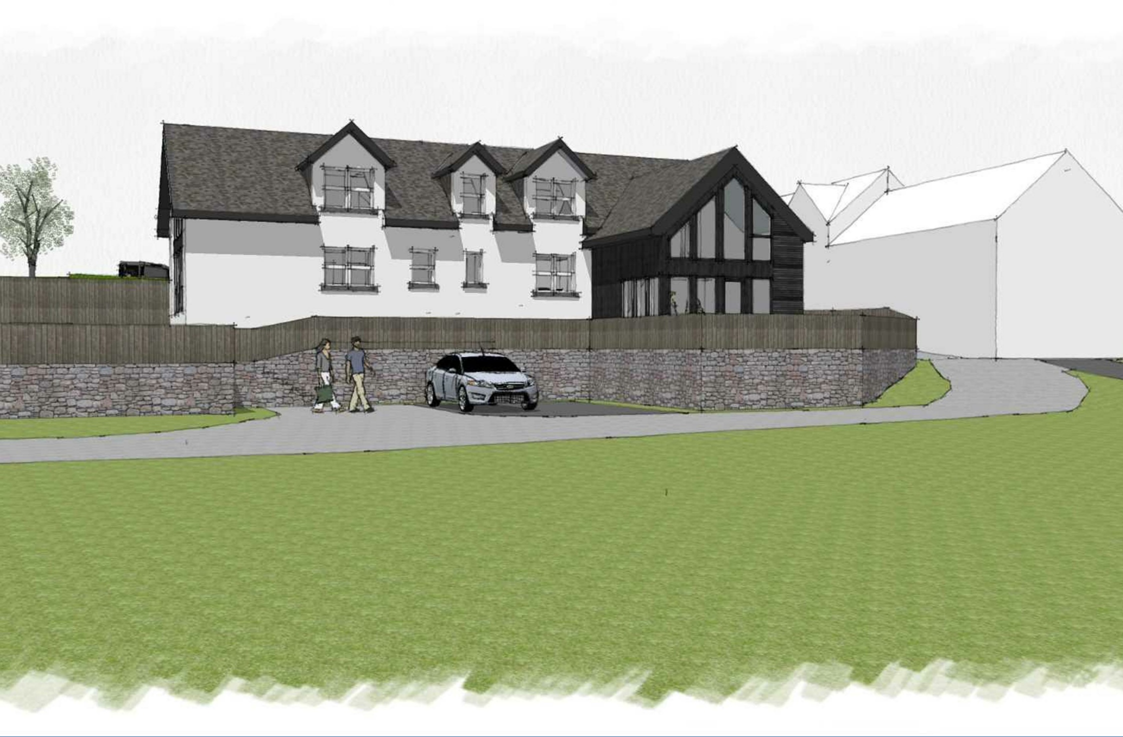
Two House Plot Torbeg Farm Development, Torbeg, Blackwaterfoot, KA27 8HE