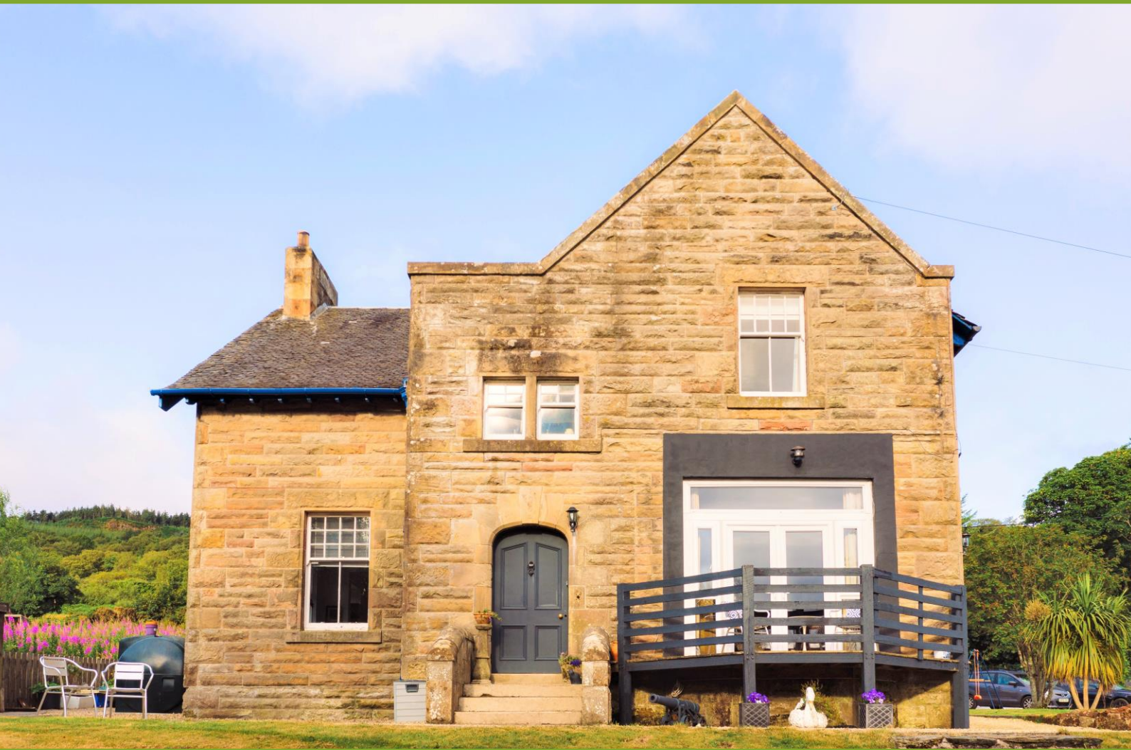
— Ardmhor House and Norah's Cottage, Whiting Bay —