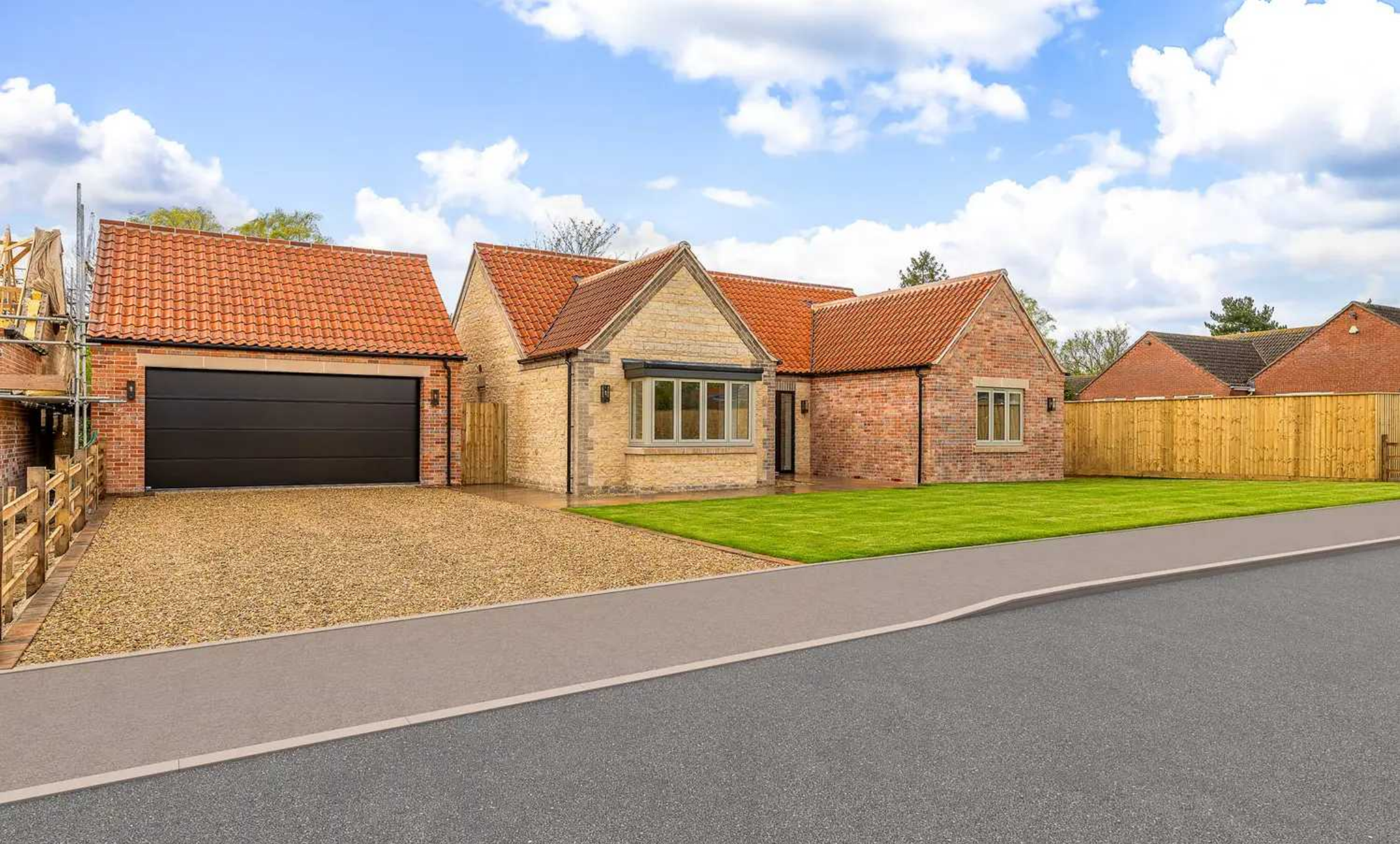
Plot 1, The Orchards, Dunston £575,000