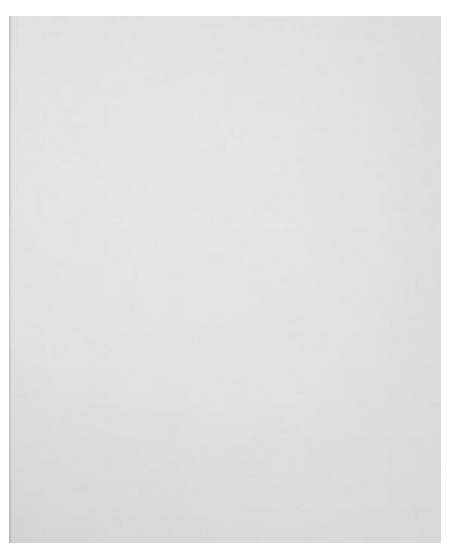
Dove Grey cupboard

This image is for illustrative purposes only and is not a photograph representative of what has been installed at Vasey Fields, Bassingham.