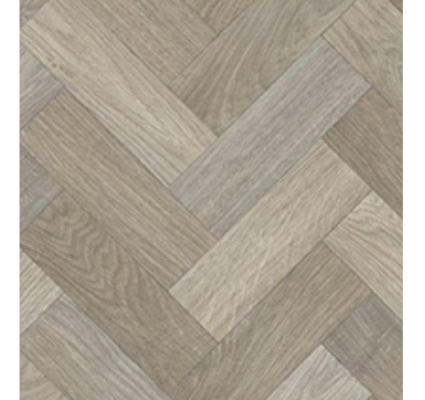
Authentic Grey Oak Block worktop