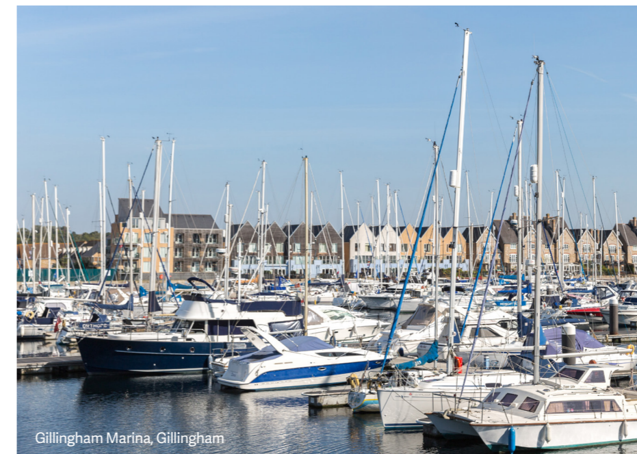
Gillingham Marina, Gillingham