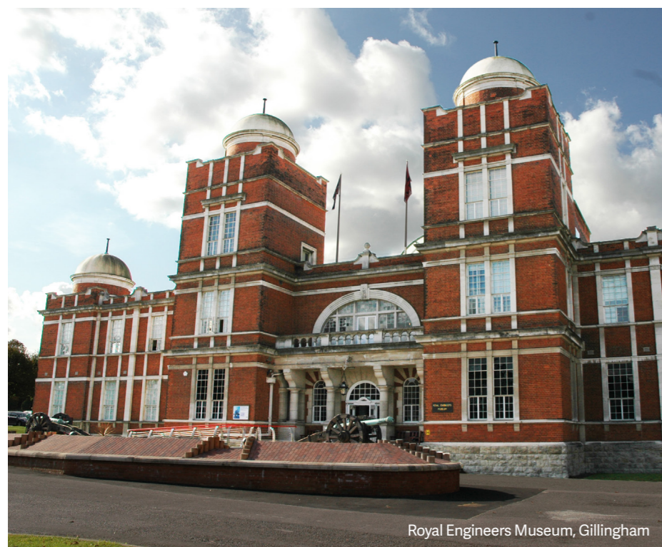
Royal Engineers Museum, Gillingham