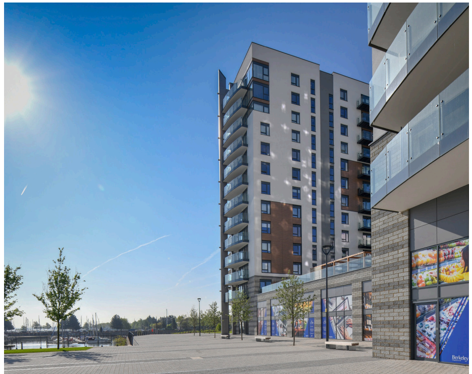
Floorplans and photography are indicative only.