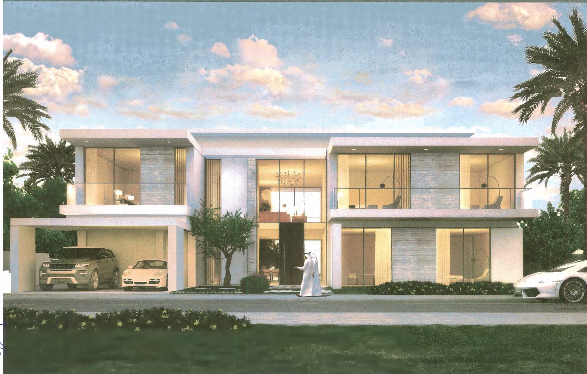
TYPE B3 MODERN