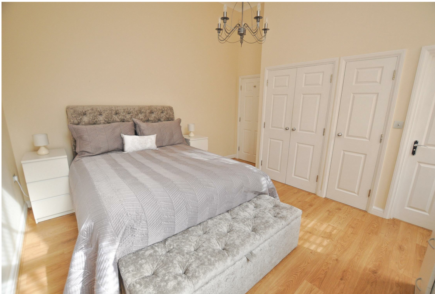
Logan Court London Colney, AL2 1GD