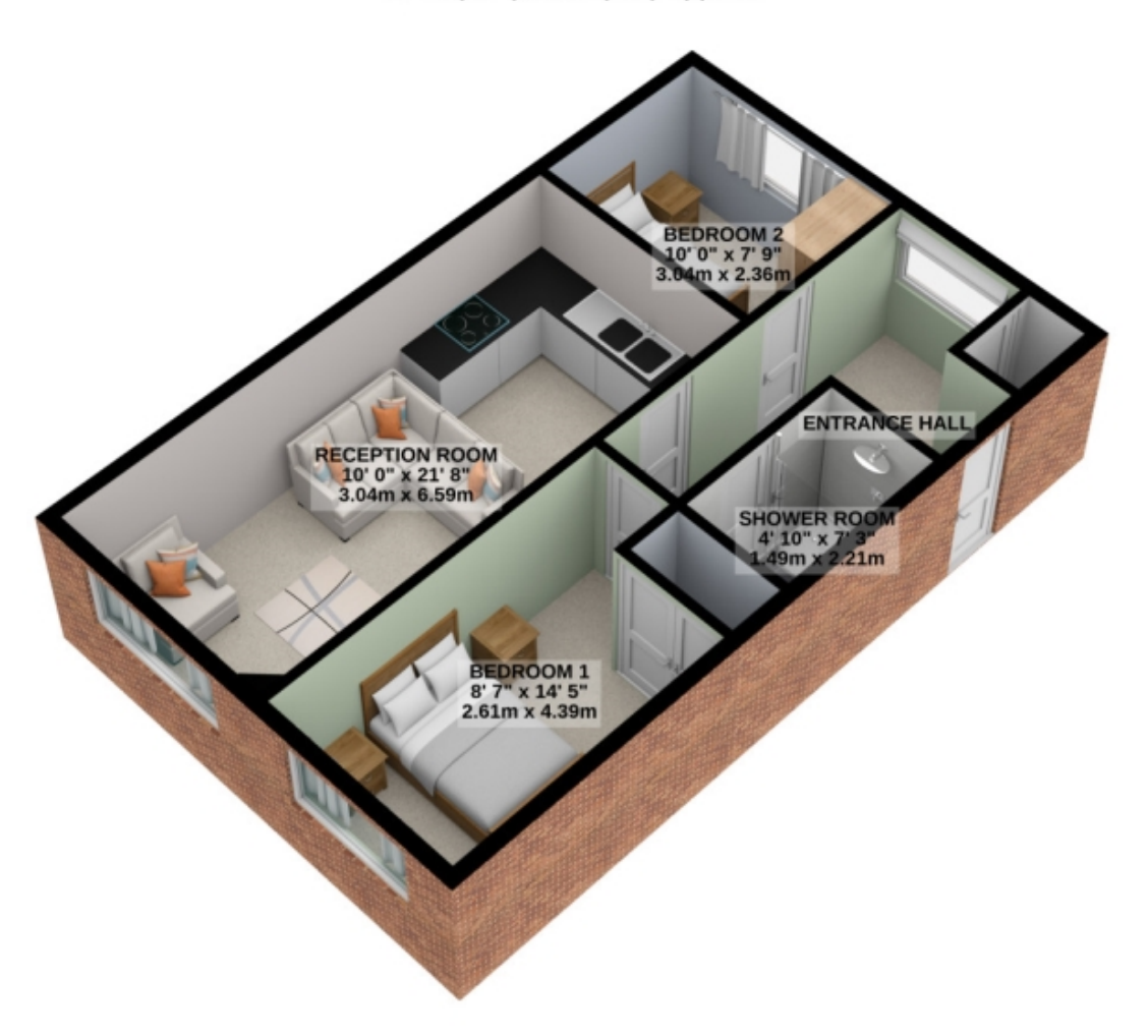
GROUND FLOOR 544 sq.ft. (50.6 sq.m.) approx.

ASHERIDGE ROAD, CHESHAM, BUCKINGHAMSHIRE. HP5 2PY TOTAL FLOOR AREA: 544 sq.ft. (50.6 sq.m.) approx.