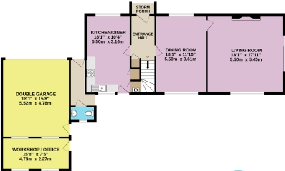
GROUND FLOOR 1302 sq.ft. (120.9 sq.m.) approx.