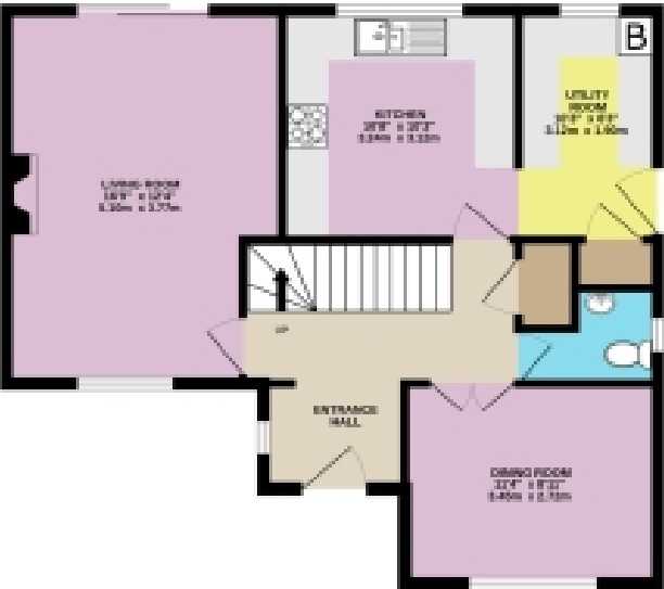
GROUND FLOOR 653 sq.ft. (60.6 sq.m.) approx.