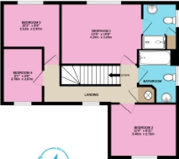
1ST FLOOR 579 sq.ft. (53.6 sq.m.) approx.