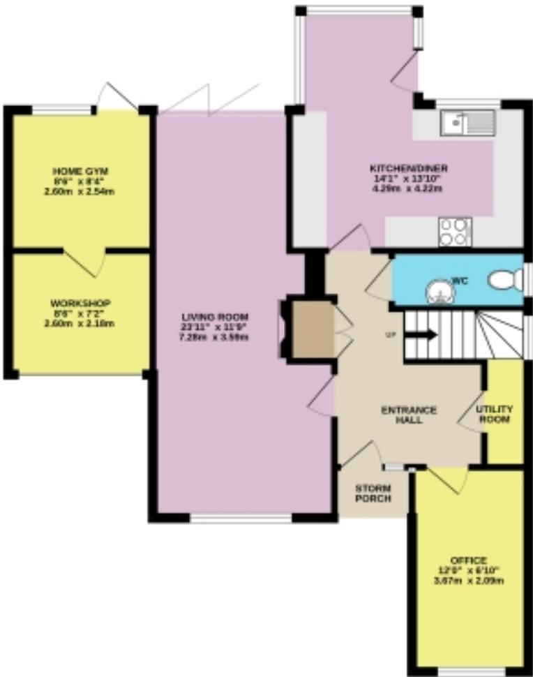
GROUND FLOOR 763 sq.ft. (70.9 sq.m.) approx.