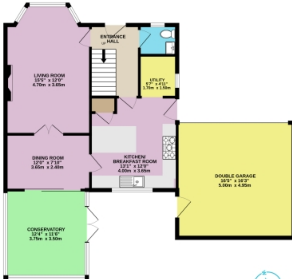
GROUND FLOOR 990 sq.ft. (92.0 sq.m.) approx.