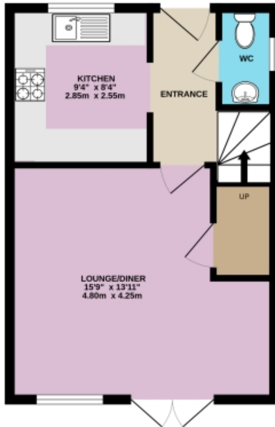
GROUND FLOOR 367 sq.ft. (34.1 sq.m.) approx.