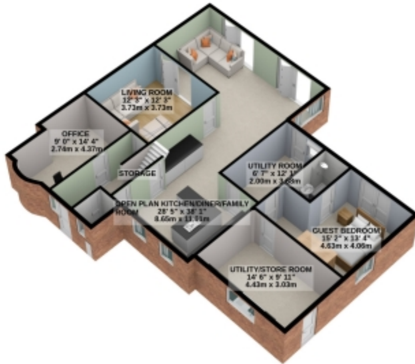
GROUND FLOOR 1246 sq.ft. (115.7 sq.m.) approx.