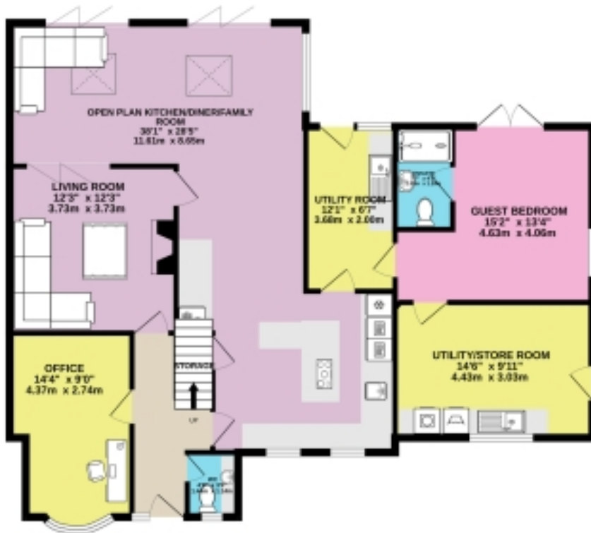
GROUND FLOOR 1246 sq.ft. (115.7 sq.m.) approx.