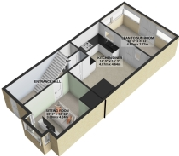
GROUND FLOOR 627 sq.ft. (49.0 sq.m.) approx.