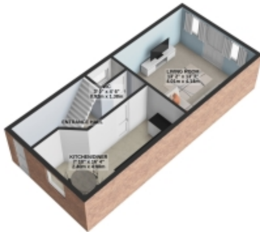
GROUND FLOOR 394 sq.ft. (36.6 sq.m.) approx.