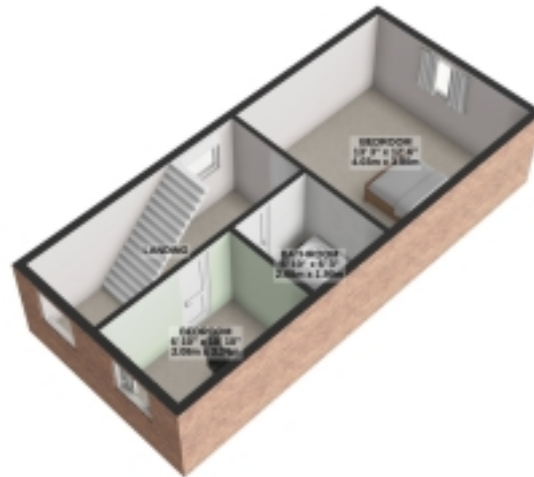
1ST FLOOR 366 sq.ft. (33.8 sq.m.) approx.