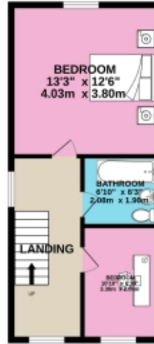
1ST FLOOR 390 sq.ft. (36.0 sq.m.) approx.