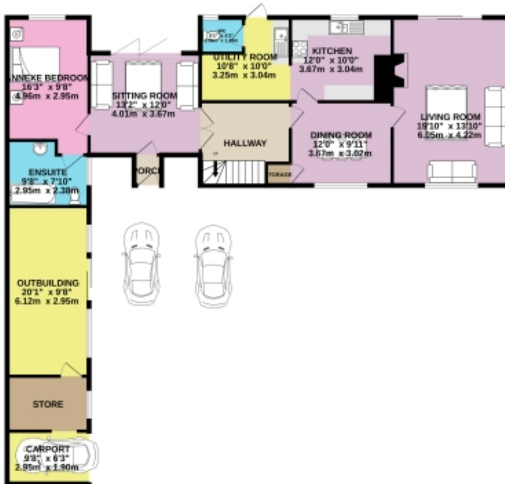
GROUND FLOOR 1413 sq.ft. (131.3 sq.m.) approx.