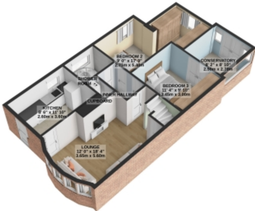
GROUND FLOOR 721 sq.ft. (67.0 sq.m.) approx.