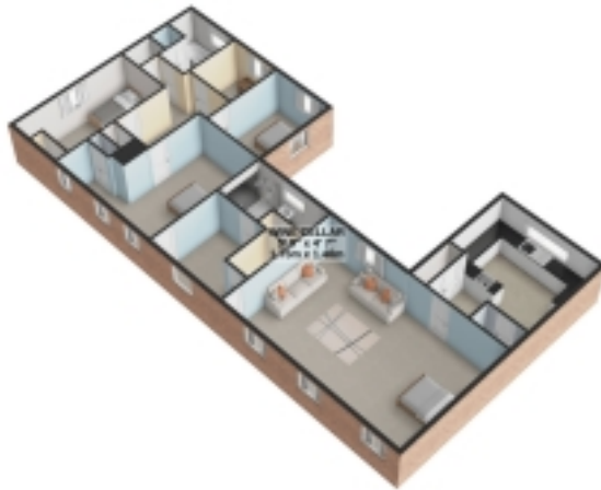
BASEMENT 66 sq.ft. (6.2 sq.m.) approx.