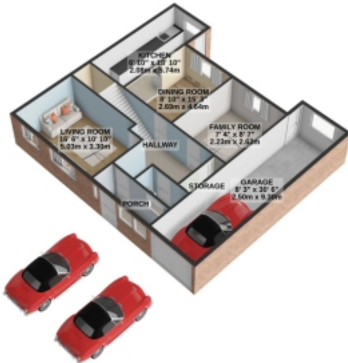
GROUND FLOOR 1039 sq.ft. (96.5 sq.m.) approx.