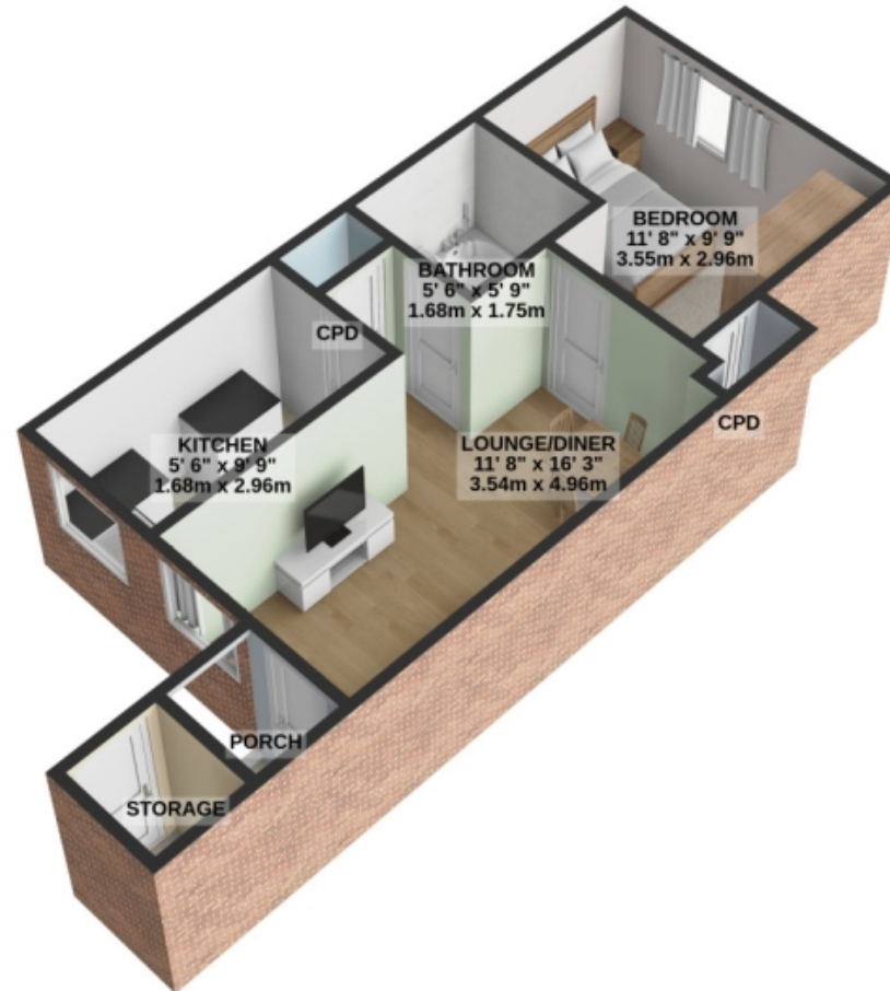
1-BED GROUND FLOOR FLAT TOTAL FLOOR AREA : 369 sq.ft. (34.3 sq.m.) approx.

For illustrative purposes only. Decorative finishes, fixtures, fittings and furnishings do not represent the current state of the property. Measurements are approximate. Not to scale.