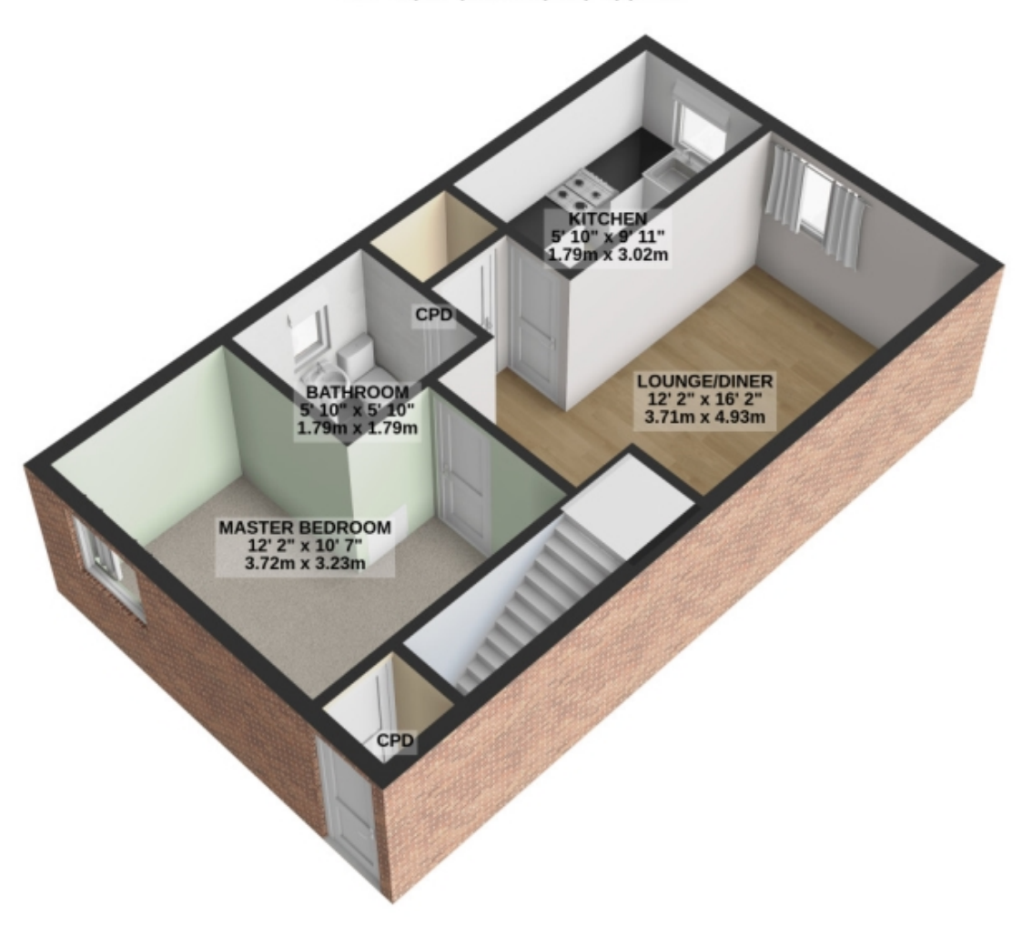
GROUND FLOOR 407 sq.ft. (37.8 sq.m.) approx.

1 BED FIRST FLOOR FLAT TOTAL FLOOR AREA: 407 sq.ft. (37.8 sq.m.) approx.